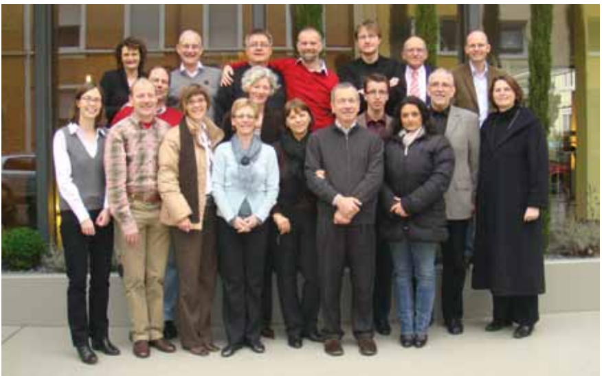
Participants at the International Distributors Conference, January 2009, Germany

If so, become an exclusive country partner of persolog®.